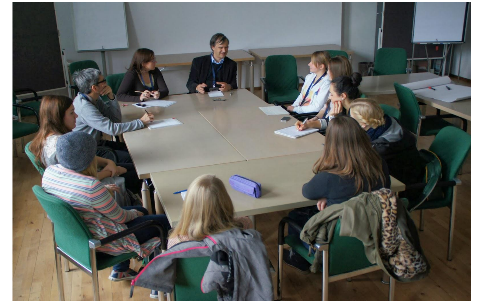
Fig.1: Students discussing their research projects with experts from science, business and politics during a research-exchange workshop

Responding to key challenges of the 21 st century, such as global climate change, requires a complex process of societal transformation. While the body of (physical) system and target knowledge is growing steadily, there is not yet an equivalent understanding of the societal challenges of global climate change and effective measures to react or even “proact” accordingly. The production of transformation knowledge in a transdisciplinary approach is vital to develop and apply dialogic and target-group oriented formats tackling the complex challenges connected to global climate change and inducing a transformation towards sustainable development. Young people play an important role in this process of societal transformation due to many reasons. Therefore, integrating and engaging them in the climate change debate as early and intensively as possible is an important fundament for a more sustainable future. At the moment, there are only few specific target-group oriented and field-tested approaches to impact teenagers’ knowledge, attitude, and behavior. Ever since the ambitious climate policy goals set at COP 21, it is time to make use of existing knowledge in different disciplines and establish effective and sustainable research-education cooperations. In this context, the following research questions arise.