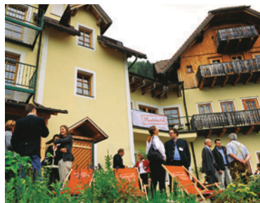
Steinschaler Dörfel in the Pielach Valley